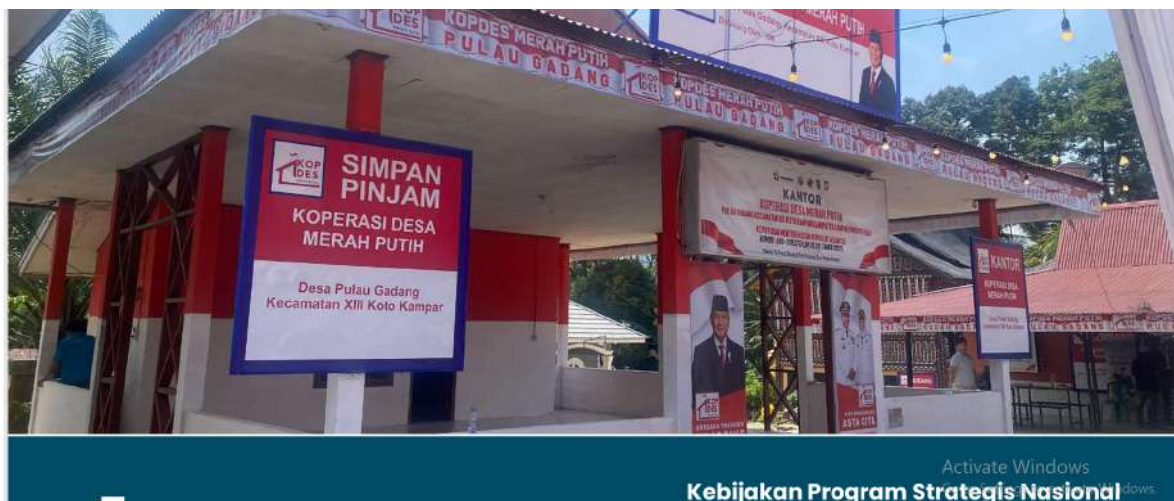
Figure 1. One of KDMP outlets.